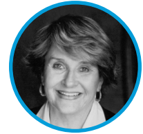
Rep. Louise Slaughter (D-NY)