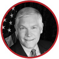
Rep. Pete Sessions (R-TX)